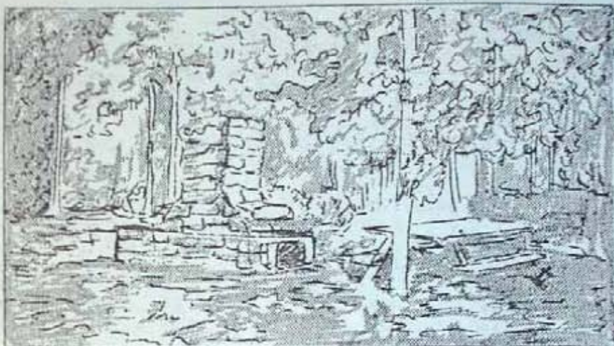
THE PICNIC AREA

On April 13th, the camp was quarantined for in-